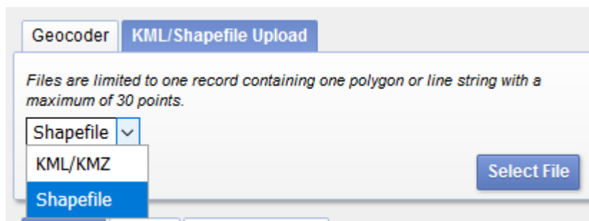
Figure 2 - Upload ESRI Shapefile

Select the 'KML/Shapefile' tab to display the input form for uploading ESRI Shapefile information for a search area (Figure 2). Select the Shapefile option. Shapefiles are limited to one record containing one polygon or line string with a maximum 30 points. The shapefile dialog box allows for the upload of a zip file containing .shp, .shx, .dbf and .prj files. Click on 'Select File'.